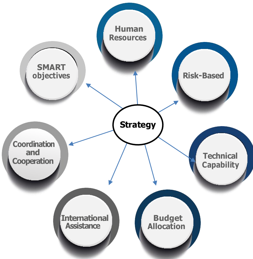
Figure 2. Strategic framework

The diagram below outlines all the various factors that should be taken into account for the implementation and monitoring of the Strategy.