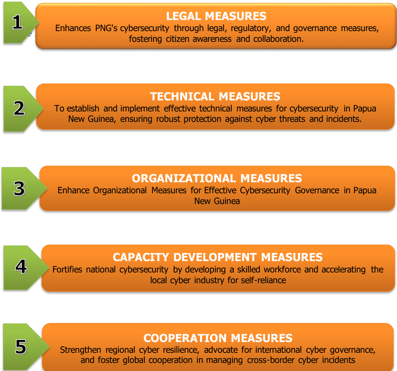
Figure 1: Strategic Focus Areas

Cyber Resilience & Cyber Defence Mechanisms